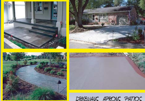
DRIVEWAYS APRONS PATIOS SIDEWALKS FRONT PORCHES STOOPS CURBS

You can count on our concrete experts to make your new concrete functional and beautiful. Why deal with crumbling, cracked and shifted surfaces that detract from the rest of your property and create hazardous conditions. New concrete will transform your property with an updated, clean, and maintained look that is sure to improve the curb appeal.